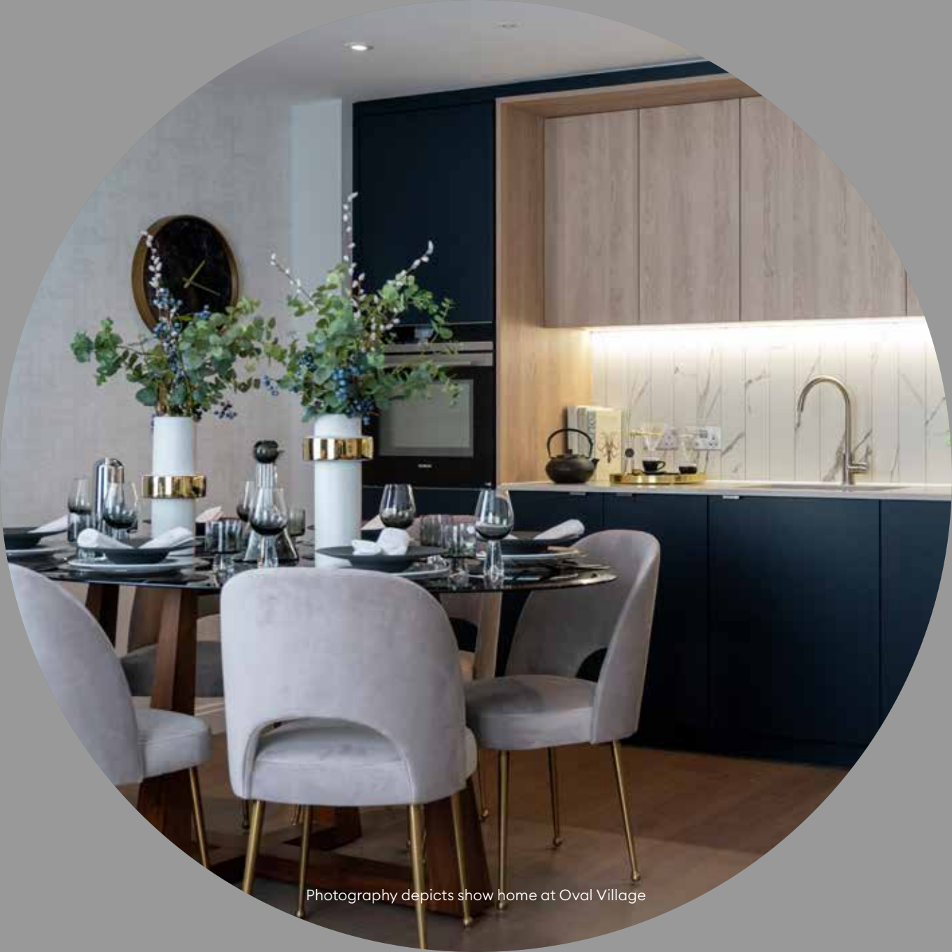
Photography depicts show home at Oval Village